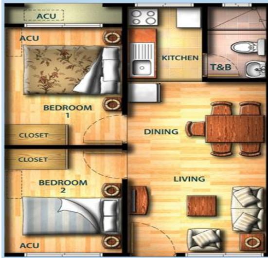
2-BEDROOM UNIT 38 sqm ±